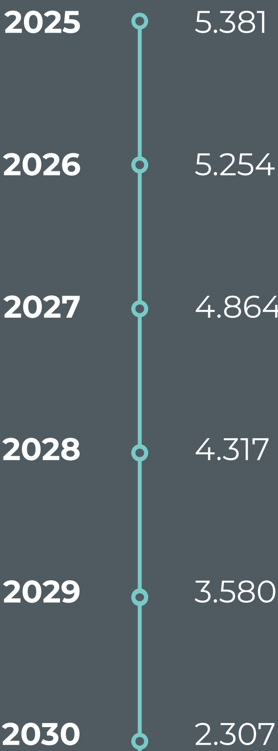
Emission per employee projections

Our emissions goals are calculated based on the intensity of scope. At Summer Friday, this means the reduction of our emissions is proportional to the number of employees at the company. Hitting our target goal will be a combination of reduction and offsetting.